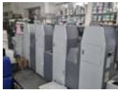
Reference number: 23050 RYOBİ 524 GX Sheet-fed Offset Printing Machine