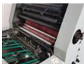
Reference number: 19045 ADAŞT DOMINANT 515 + UV AEROTERM OL 620 Sheet-fed Offset Printing Machine