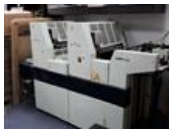
Reference number: 21039 ADAŞT DOMINANT 524 Sheet-fed Offset Printing Machine

Year of Production: about&nbsp;1985 ; Number of Colours: 2 ; Counter: - ; Max. Size: 381x520 mm (15.0"x20.5") approx. B3 ; Availability: immediately ; conventional dampening, low pile delivery, manual plate loading, Bacher quick action plate clamps including punching machine