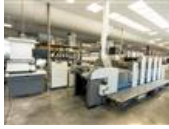
Reference number: 23040 RYOBİ 524 GX + L Sheet-fed Offset Printing Machine